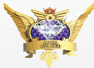
ROYAL ADMIRAL APPLE LOW PEI LING

A delicate pamper for your intimate area